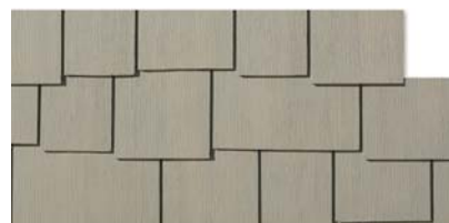
Color Shown: Monterey Taupe

See reverse side for Trim & Soffit Offering.