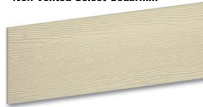
Color Shown: Navajo Beige