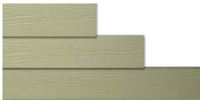
Color Shown: Heathered Moss