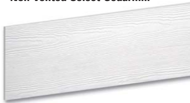
Color Shown: Arctic White