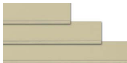
Color Shown: Sandstone Beige