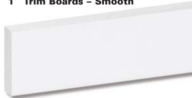
Color Shown: Arctic White