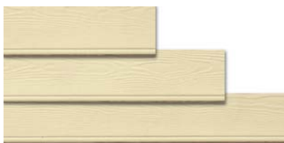
Color Shown: Woodland Cream