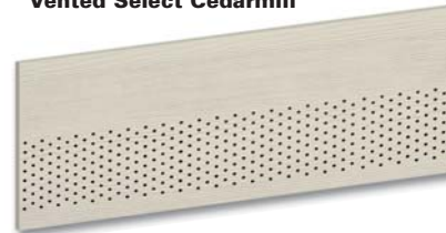
Color Shown: Cobble Stone