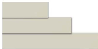
Color Shown: Cobble Stone

Beaded Select Cedarmill® and Beaded Smooth