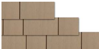
Color Shown: Khaki Brown