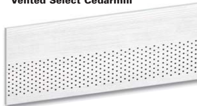
Color Shown: Arctic White